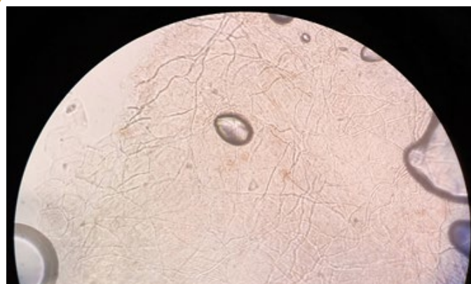
Figure 1 KOH mount of the skin scraping showing hyaline septate fungal hyphae at 40x.

The clinical profile of the patients showed that, Tinea corporis